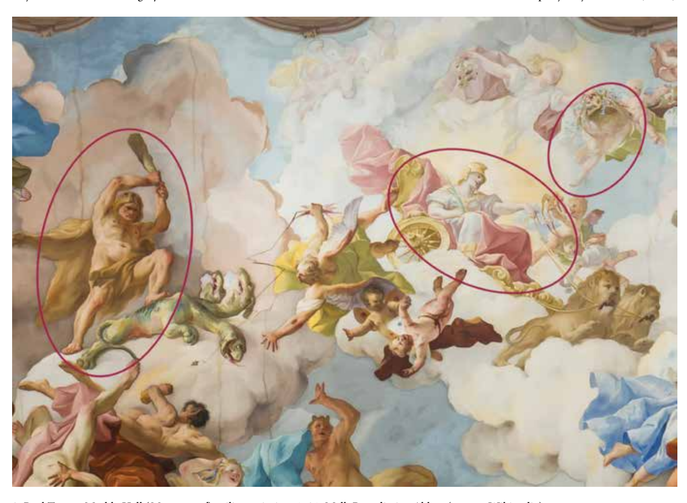
8. Paul Troger, Marble Hall ( Marmorsaal ) ceiling painting, 1731, Melk Benedictine Abbey Paul Troger, slika na svodu Mramorne dvorane (Marmorsaal), 1731., Melk, benediktinska opatija

distinguished guests - most notably members of the royal court - is adorned by a fresco showing Heracles fighting Cerberus in the presence of Athena, who is riding a chariot drawn by two lions (Fig. 8). They are surrounded by putti and figures representing vices and virtues, which indicate the fresco's symbolic reading: the struggle and triumph of virtue over vice, good over evil.53 The fresco was painted by a well-known Austrian artist, Paul Troger (Monguelfo, 1698 - Vienna, 1762), in 1731. If we compare the Melk fresco with the Čakovec easel painting, we will notice particular similarities in the impostation of the two main mythological figures: that of Heracles with his arms raised high above his head forming a characteristic rectangular shape, and that of seated Athena with a slight inclination of the head following the movement of her outstretched arm and parted legs with drapery stretched between them. Similarities can also be found in the impostation of a third figure, namely the putto holding a flower basket in Melk, i.e. a column in the Čakovec painting (Fig. 3), with its right leg bent far behind.