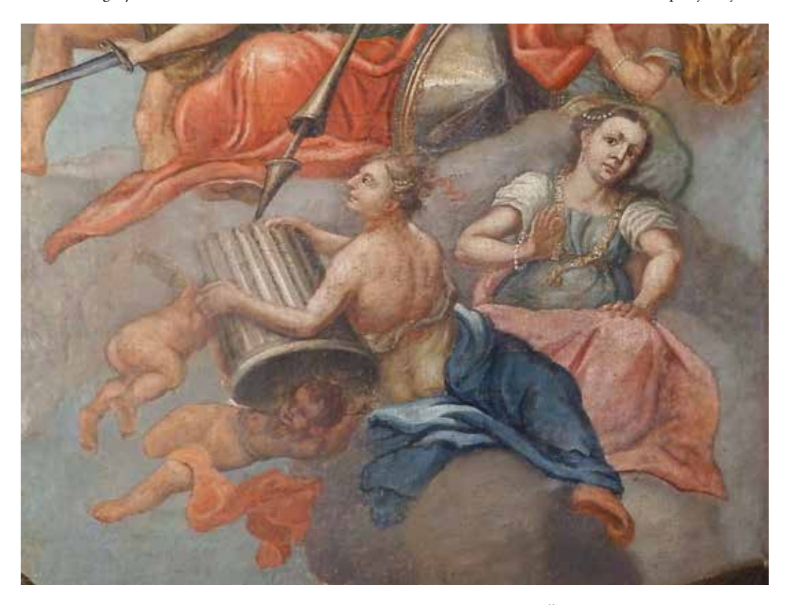
3. Detail of the allegory: personifications of fortitude and honour Detalj alegorije: personifikacije jakosti i časti