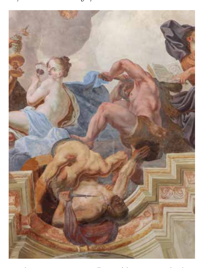
11. Johann Caspar Waginger, Allegory of the Five Senses, detail, ca. 1718, fresco, Brežice Castle Johann Caspar Waginger, Alegorija pet osjetila, detalj, oko 1718., dvorac Brežice

Maria, Count of Attems (Ljubljana, 1652 – Graz, 1732).<sup>57</sup> Apart from the mythological theme and basic compositional parallels (celestial background, the use of di sotto in sù ), the example from Slovenska Bistrica shares few similarities with the painting from Čakovec.