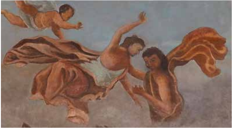
6. Comparison of the painting's former and present state: female and male figures

Usporedba prethodnog i sadašnjeg stanja slike: ženski i muški lik