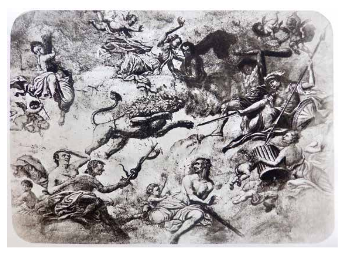
5. Reproduction of the allegory published in Károly Zrínyi's monograph on Čakovec Reprodukcija alegorije objavljena u Zrínyijevoj monografiji grada Čakovca

at the end of the 18<sup>th</sup> century made him rather eclectic,<sup>29</sup> his skills far surpassed those displayed by the person who tried to retouch the canvas exhibited at the museum.