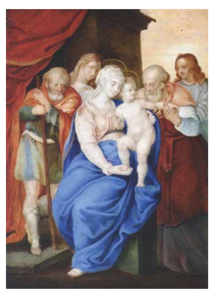
5. Giulio Clovio, The Holy Family with Saints , undated, gouache on ivory, 19.6 \times 14.3 cm, unknown location

Julije Klović, Sveta obitelj sa svecima, nedatirano, gvaš na slonovači, 19.6 \times 14.3 cm, nepoznata lokacija