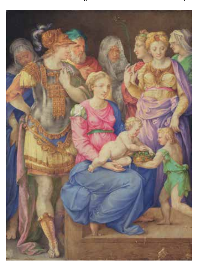
2. Giulio Clovio, The Holy Family with a Man in Armour , ca. 1553, tempera on vellum, 17.5 \times 9.13 cm, Musée Marmottan, Paris, Inv. No. M 6119 Julije Klović , Sveta obitelj s muškarcem u oklopu, oko 1553., tempera na pergamentu, 17,5 \times 9,13 cm, Musée Marmottan u Parizu, Inv. No. M 6119

According to Clovio's description, the composition consists of a central group featuring Madonna and Child with St Simeon, surrounded by other figures with a merely decorative purpose ( per il hornamento del quadro <sup>38</sup>). As E. Calvillo has indicated,<sup>39</sup> Clovio often used this kind of compositional hierarchy with primary and secondary groups of figures, especially in his cabinet miniatures. Several of his other miniatures with a similar Holy Family theme have been preserved, such as the two miniatures at Musée Marmottan