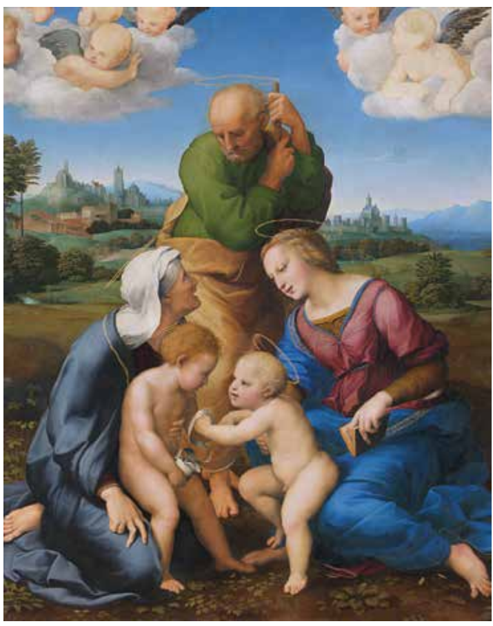
6. Raphael, The Canigiani Family , 1507, oil on panel, 131 \times 107 cm, Alte Pinakothek, Munich, Inv. No. 476

Julije Klović, Sveta obitelj sa svecima, nedatirano, gvaš na slonovači, 19.6 \times 14.3 cm, nepoznata lokacija